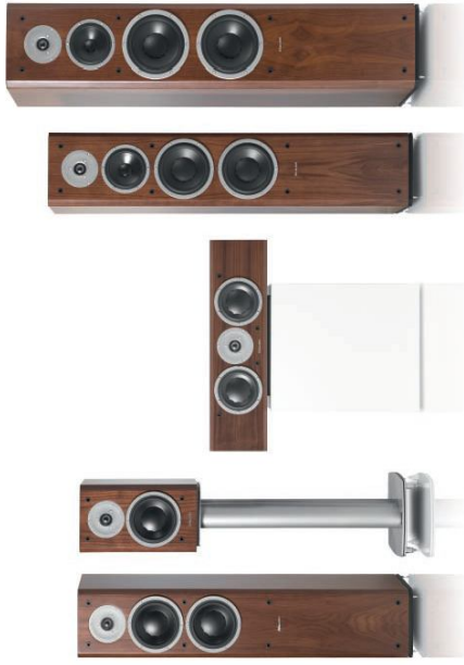
Every Dynaudio loudspeaker is carefully made in Denmark. Find more information at www.dynaudio.com .

Everyone who loves music not only wants to hear it, but to experience it – everywhere.