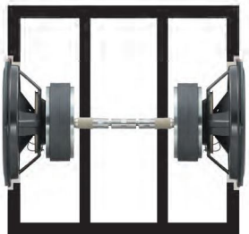
R2R Twin Driver

Drive-units require sufficient power to displace a large volume of air in order to reproduce low frequencies. Although large drive-units are required to reproduce low frequencies with a characteristic richness and punch, both the volume of air displaced and the weight of the driver unit increase in proportion to the size of the unit. The sheer bulk involved results in inertia and the movement of the cone is slowed or delayed so creating a delay in the bass sounds relative to the rest of the music. To solve this problem the TD725sw uses two comparatively small 25cm driver units which are mounted horizontally in a back-to-back configuration. This unusual design offers both power and high speed, whilst still achieving the displacement of air equivalent to the use of a big, heavy and slow conventional 35cm diameter drive-unit.